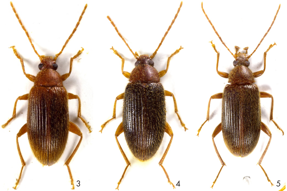
Fig. 1: Habitus of the Borboressthes Fairmaire, 1897 from dorsal view (type species Borboressthes cruralis (Marseul, 1876)) Fig. 2: Habitus of the Allecula Fabricius, 1801 from dorsal view (type species Allecula morio (Fabricius, 1787)) Fig. 3: Habitus of Borboressthes bilamellatus (Marseul, 1876) comb. nov. from dorsal view. Fig. 4: Habitus of Borboressthes okinawanus (Akita & Masumoto, 2015) comb. nov. from dorsal view. Fig. 5: Habitus of Borboressthes simiolus (Lewis, 1895) comb. nov. from dorsal view.